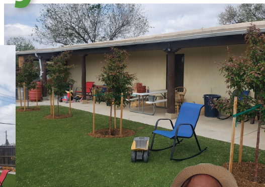
After: a peaceful playground