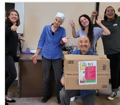
Non-residential staff at back pack giveaway