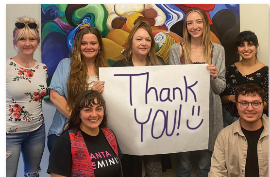
Esperanza shelter staff