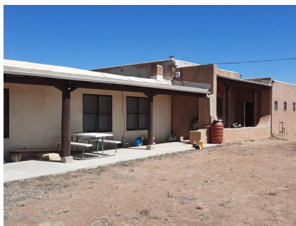
Before: a desert landscape